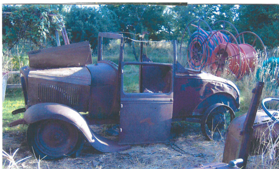
1929 Sport Coupe