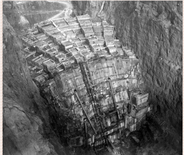
Construction of forms for cement

July 7, 1931 -- Ice vending machines introduced