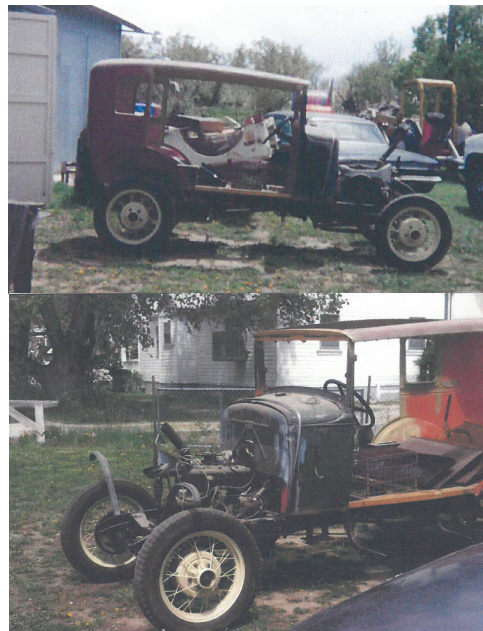
1930 Deluxe Town Sedan