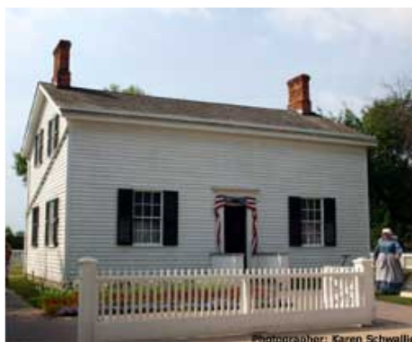
Henry Ford's birthplace

We celebrate his 150th birthday on July 30. He was born in 1863 in Greenville Township, Michigan.