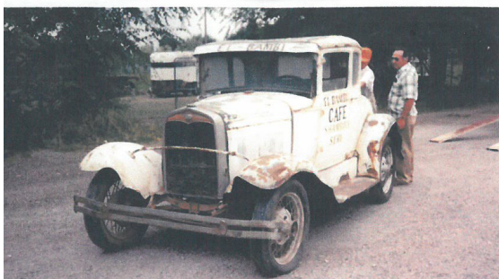
1931 Standard Coupe

Here are some of the treasures I've found through the years: